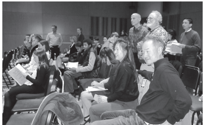
Audience in the concert listening to the new works with joy.