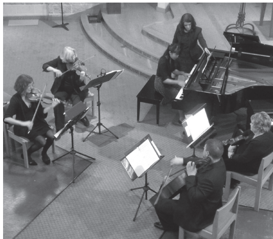
Students performed with members of the Londontowne Symphony at the first AAMTA Chamber Music Festival