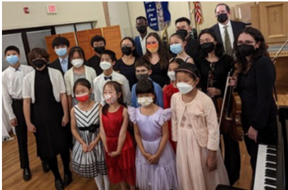
Honors Concerto performers from the Orchestra Concerto Competition