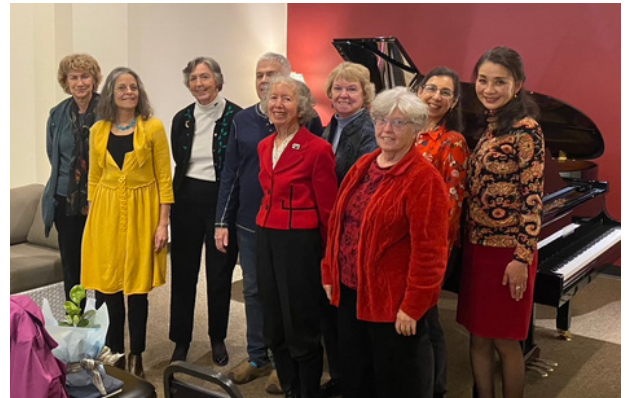
10th Anniversary Matinee Group Photo