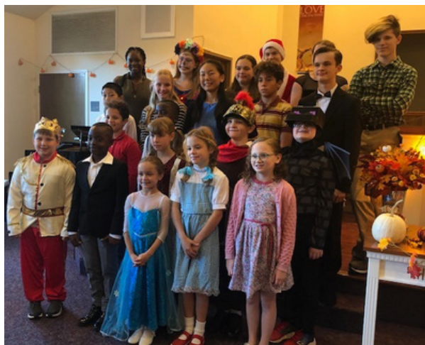
Photos from MTAB Autumn Harvest Festival October 28, 2022