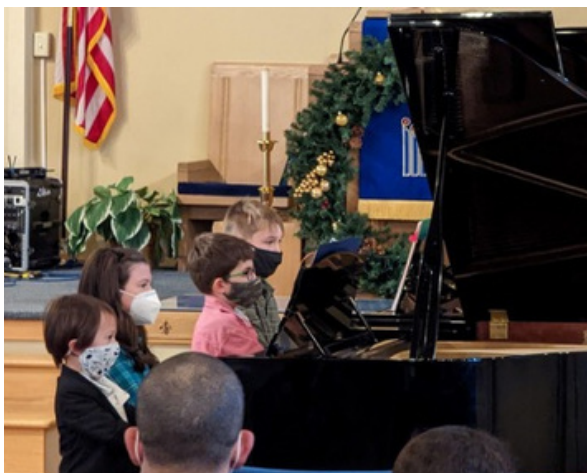
A piano quartet performs for Ensemble Festival