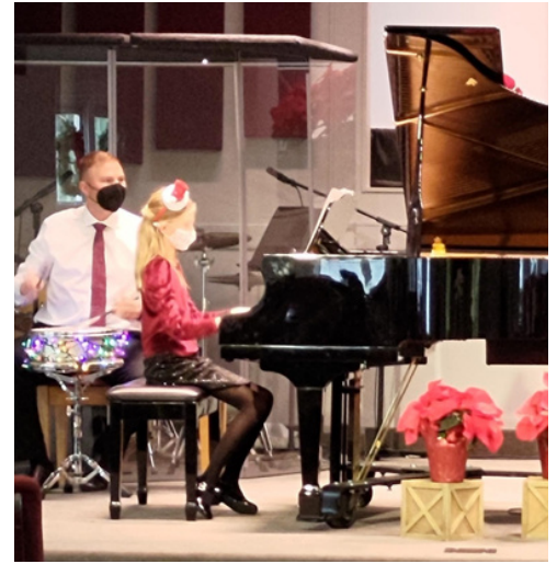
Holiday Program, December 2022 at Severna Park Baptist Church