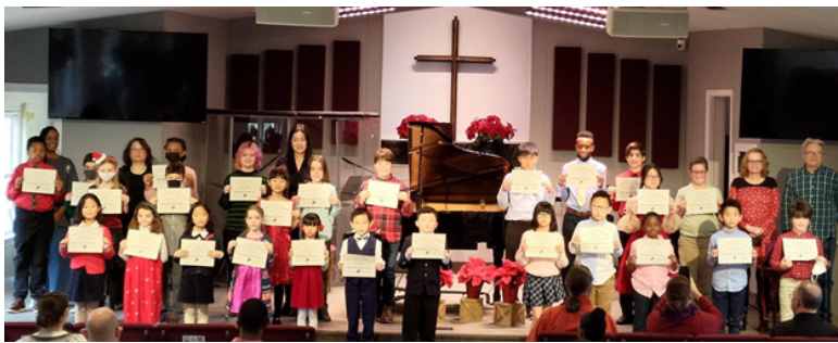
Holiday Program, Severna Park Baptist Church, December 2022