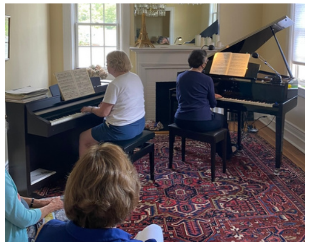
10th Anniversary Matinee