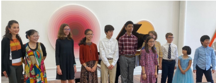
Student Recital, November 5th