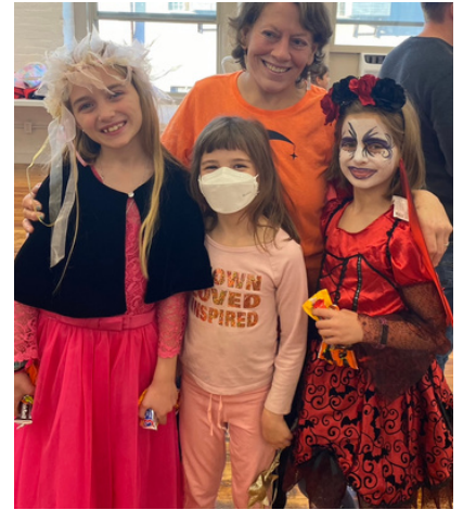
Halloween Concert, October 29th