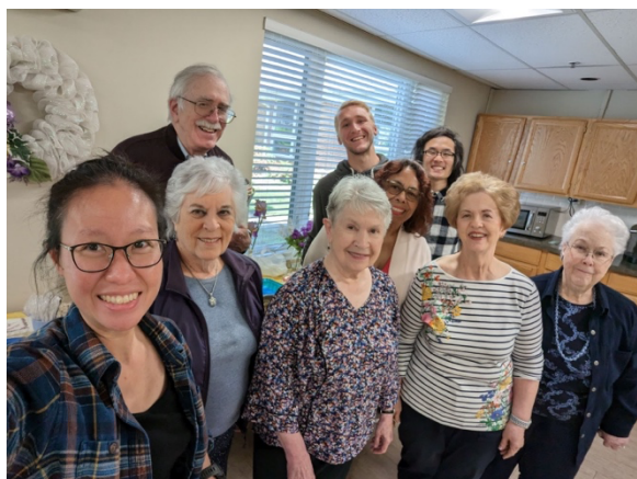
GLMTA May Luncheon