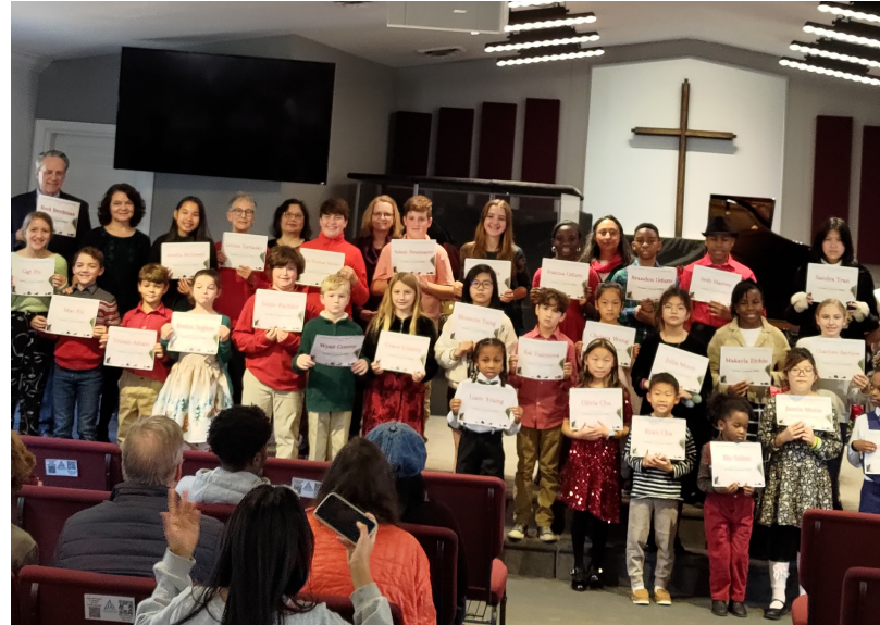
Holiday Festival Photo