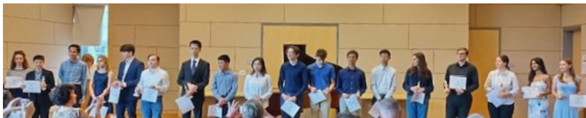
Class of 2024 Seniors Recognized for at least six years of study with an MCMTA teacher.

The final two events of our school year were held at a couple of Montgomery County Libraries. The Gaithersburg Public Library was the location for the Senior Recognition Awards Ceremony, and after an exhaustive location search, the Marilyn Praisner Branch Library was where our Adult Piano Recital occurred.