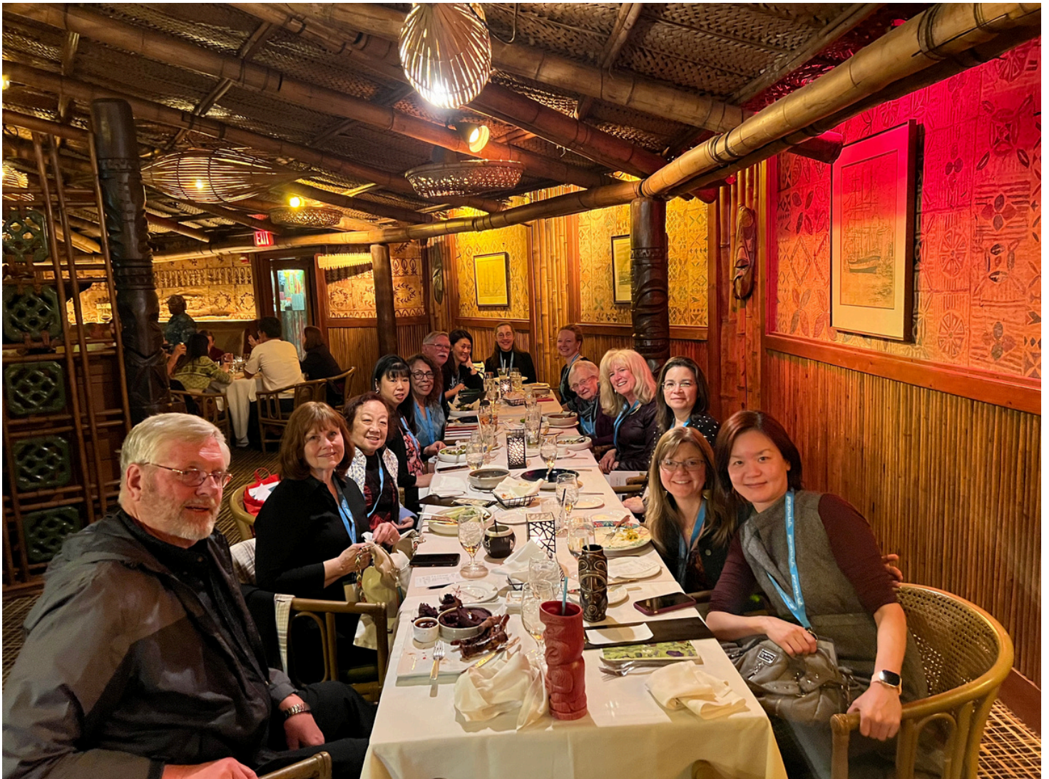
MSMTA members and guests at our dinner gathering