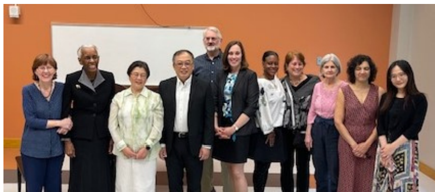
Adult Recital 2024, Marilyn Praisner Library, Burtonsville, MD